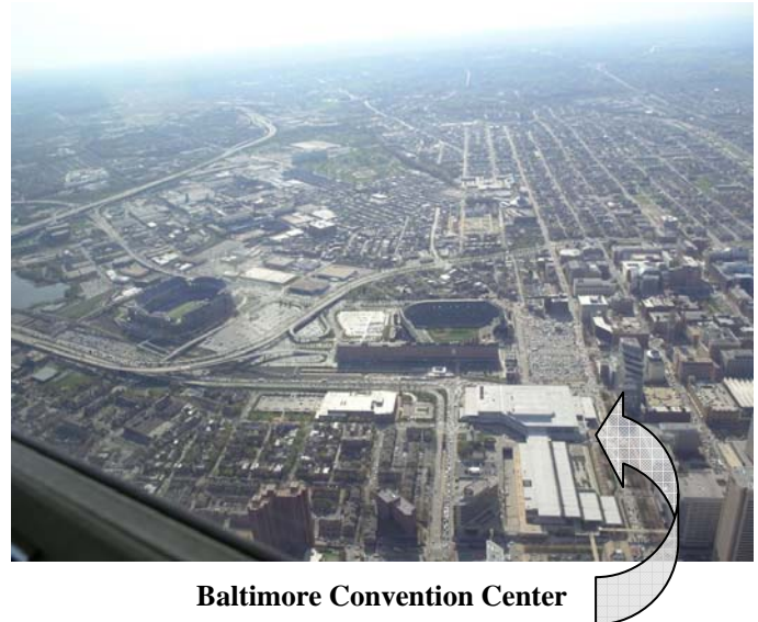
Baltimore Convention Center